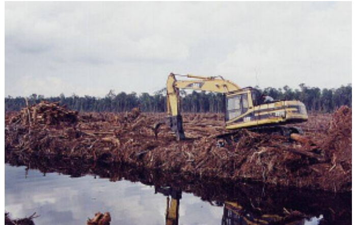
The wind breaks in the APRIL concession in Pelalawan (left) are impaired by dessication and are insufficient to retain the species diversity, which is being destroyed by clearcutting and dehydration (right).

The sensitivity of peat forest vegetation is evident from the condition of the 50 meter wide wind breaks that the corporation has not cleared. Only some individual trees with little foliage stand in these strips, and they suffer from desiccation and wind. The strips are not suited as corridors for most of the forest animals.