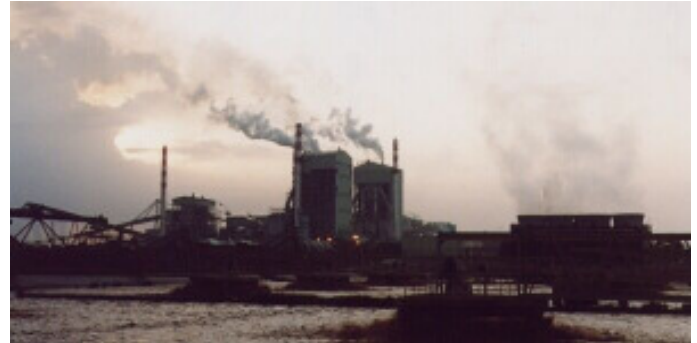
Two of the world's largest pulp factories in a country with ever decreasing forests: IKPP (left) and RAPP (right).