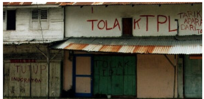
The pollution from pulp production from Toba Pulp Lestari threatens the cultural landscape at Asahan (left); the population of Porsea is resisting and demanding the closure of TPL with large writing on many house walls "Tolak TPL" (close TPL).