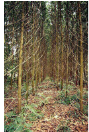
Remnant forest in the APP concession area (left); homeless elephant in a training camp in an APP Acacia plantation (right)

According to figures from the Forestry Ministry, which ROBIN WOOD has obtained, APRIL will convert another 200,000 hectares of natural forests into plantations by 2009. APP plans the destruction of another 180,000 hectares rainforest by 2007 (WWF 2004). In conjunction, production will be run solely with raw materials from plantations, according to the corporations. Then, at the very latest, there won't be any substantial timber stands in natural forests left in the vicinity of the factories anyway. Experts doubt that APP and APRIL can hold to the timetable for conversion to plantation wood (Glastra 2003). But plantations cannot substitute for the ecological and social functions of the natural forests. The species diversity and their use potential for the population are lost forever, and water and climate cycles are endangered (see chapter 4.3).