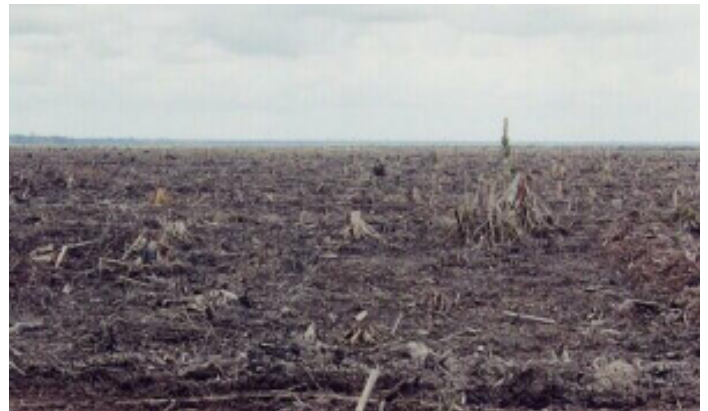
Peat forest in APRIL's Pelalawan concession (left), the clearcutting of these forests is against Indonesian law, as they are 'productive' forests. The sensitive moist areas are being extensively destroyed (right).