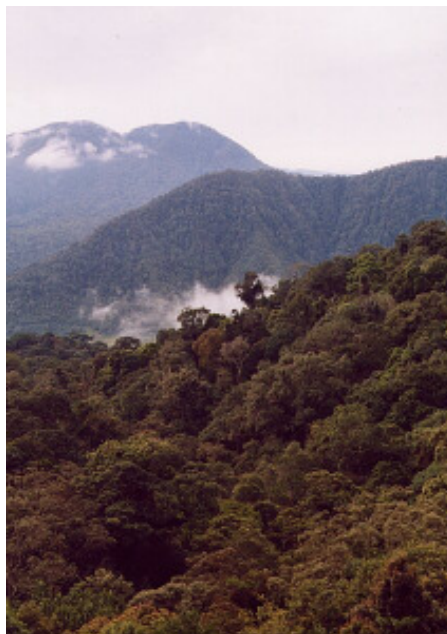
Rainforest in Northern Sumatra (at Barastagi)