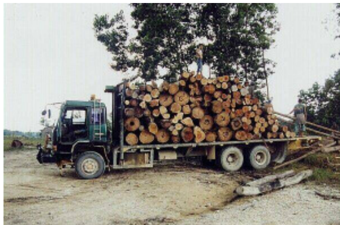
A road built by illegal loggers in the Tesso Nilo area (left); wood supply for pulp production (right), recognisable by its low quality (hollow and thin trunks).

In a Memorandum of Understanding in August 2003, WWF and APP agreed that APP would place parts of its concession areas under a moratorium that would put production on a legal and ecologically justifiable basis in the future, and would resolve land rights conflicts with the local population. Six months later WWF deflatedly discovered that according to the APP Action Plan provided to them, the corporation will clear another 180,000 hectares of forest over the next two years without checking whether the forests are of high conservation value. The corporation is also not fulfilling the agreements in regard to legal aspects of the operation and the resolution of land rights conflicts. The areas that APP intends to place under protection were designed as a reserve by the province ten years ago, and are not economically useful to the corporation, as they are bog areas (WWF 2004, Financial Times 2004, Geiger 2004).