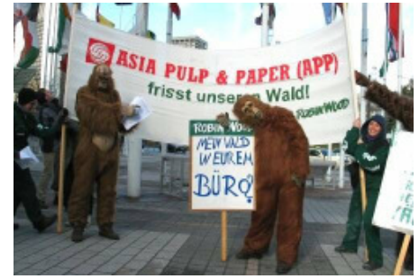
Above left: Successful ROBIN WOOD protest at Karstadt 2002: APP clearcut paper out, recycling paper in. Above center: ROBIN WOOD visit to PAPIER UNION, one of APRIL's most important European customers, 2002. Above right: ROBIN WOOD in front of the Frankfurt Trade Fair "Paperworld", the largest European paper trade fair, 2004. Below left: protest against government agency export credits for APP in front of the Ministry of Economy, November 2003 Below right: Protest at the Deutsche Post against repeated purchase of paper from rainforest destruction, 2004